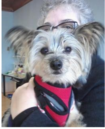
My first visit with mom