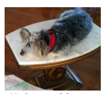
My downward dog pose