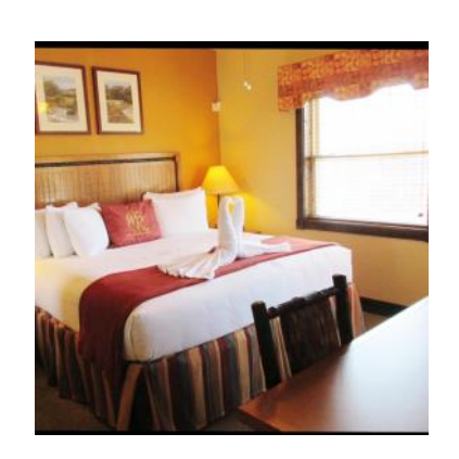
7 day/ 7 night vacation...