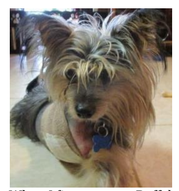
When I first came to Buffalo

I'm Mommy's little man. See, my sweater says so!