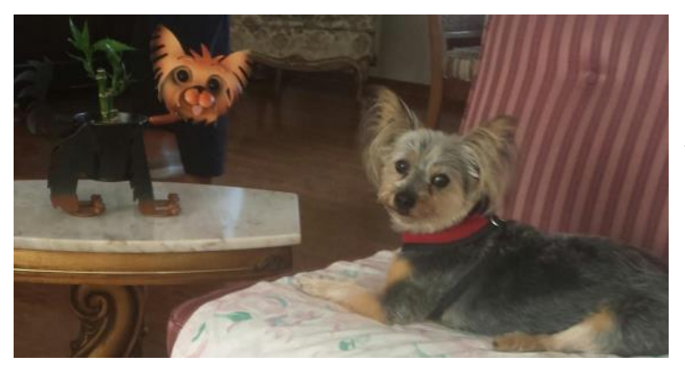
Mom has this cool planter—it looks just like me!

I'm so glad I got to come here! Thank you Buffalo Pug for helping me find my home!