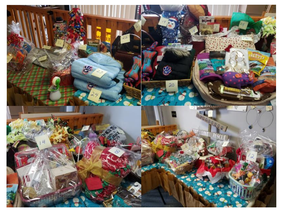
And several items for sale...