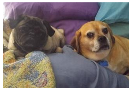
Buddy with pug sister, Cammie

Little did they know, Buddy would fit in perfectly and would never leave. Buddy's new family has officially become Buffalo Pug VIPs! They had one pug that they took in from a friend that could no longer care for her. They became involved with Buffalo Pug when they adopted a pug mix last July, another puggle in November, and now Buddy this past month. Their four-legged family has grown from 1 to 4 in just 9 months and we couldn't be happier for them!