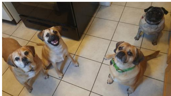
Left to Right: Buddy, Karma, Dillinger, Cammie

Learning more about his story was heartbreaking. Due to unforeseen circumstances and through no fault of his own Buddy has been shuffled to no less than seven homes since his original owner passed away. He's such a good dog and